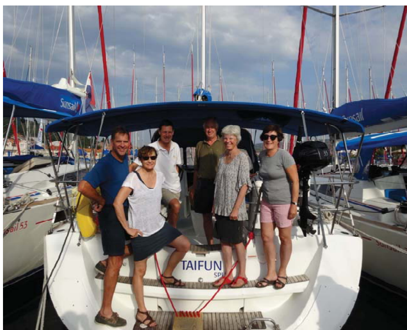
Somers six about to set sail