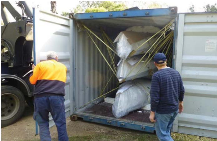
The great ceremonial opening to reveal the six new Pacers.