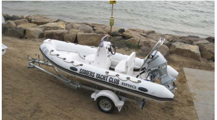
Above: The new rescue boat waiting to be named