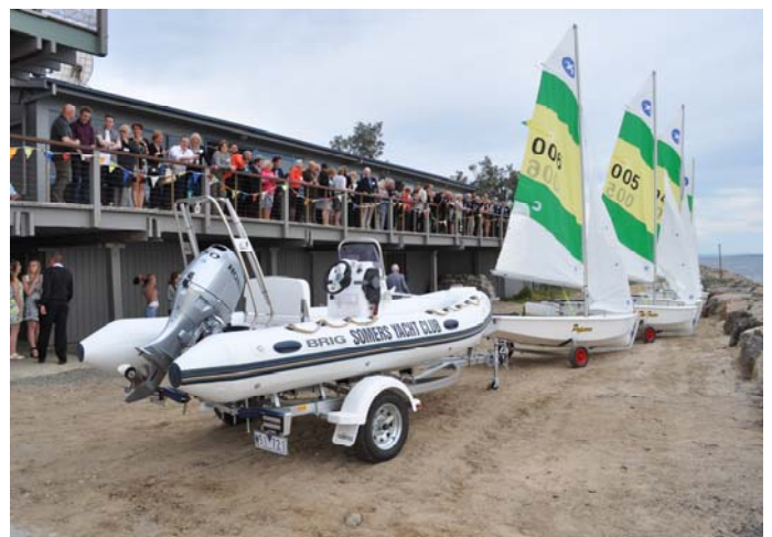
New rescue boat and pacers waiting for the Christening ceremony