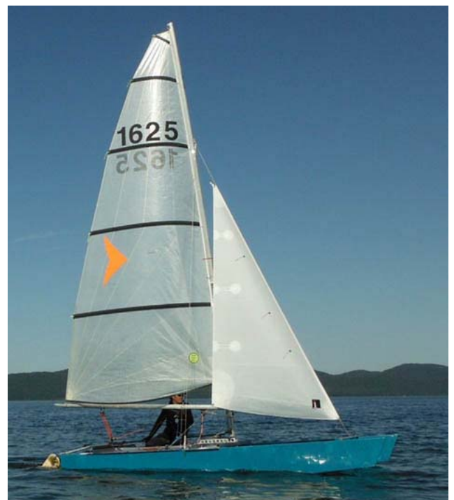
Below: Tash racing in the typical light wind conditions