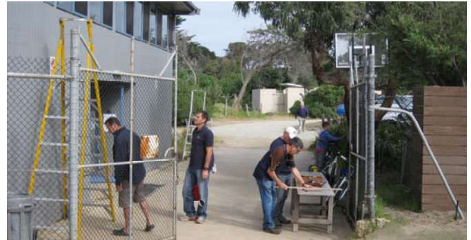
Men working hard for the club

The kitchen and bar area was subject to a thorough cleaning thanks to a number of the