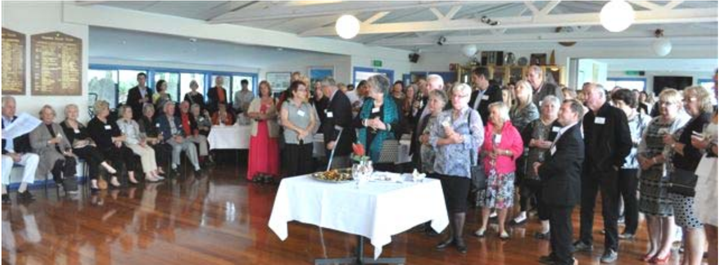
Members enjoying drinks and nibbles