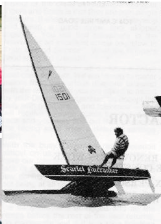
Opening Day 1985