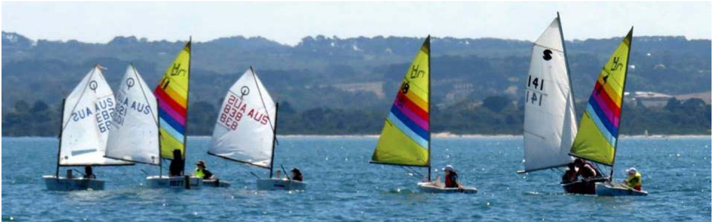
Above: The competition in Division 5 is keen as this photograph taken on 21 February shows.