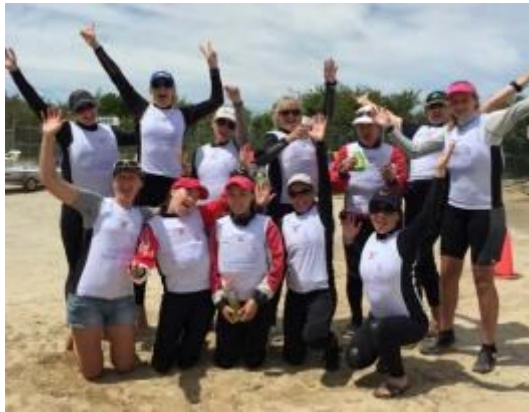
Somers YC female sailors at the 2015 regatta

Our neighbour Westernport Yacht Club is hosting the 4th Montalto Women on Water (WoW) Coaching Regatta on November 11 and 12. It is a great opportunity for Somers women and girls to gain confidence and improve their sailing in a fun and supportive event.