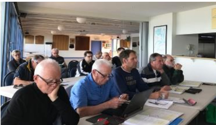
Race officers course 2017