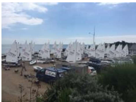
Waiting for the wind- 30 th June

UK Laser Masters National Championship, Hayling Island, UK 30 th June-2 nd July.