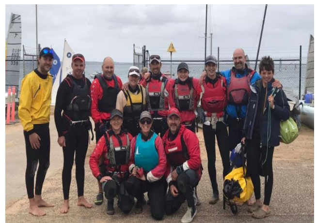
Somers Sailors at Cowes Yacht Club for the Westernport Challenge