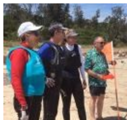
Sailors lined up and ready