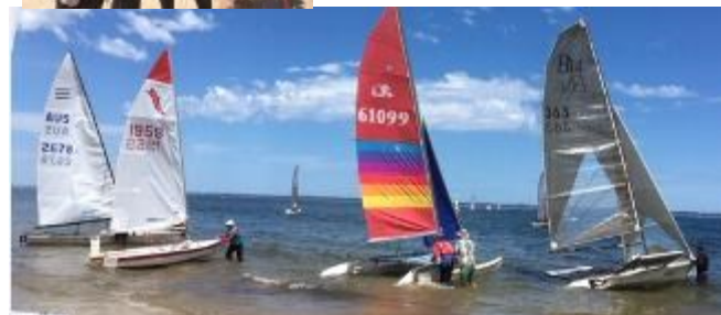
Boats ready to go