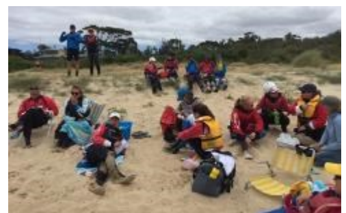
Somers participants in Teams Racing enjoy some downtime between races