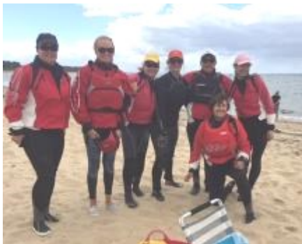
Somers Birds of Spray

Somers Little Chillies receive their awards for second place