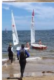
...and they are off and running