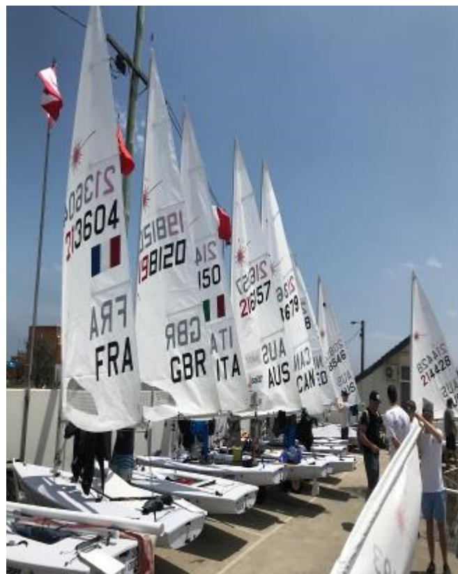
Getting ready on Day 2 (Simon 198120)

Sail Melbourne is one of the biggest sailing events in the southern hemisphere and over 350 boats entered for the event 12-16 th December. 37 Laser Standard and 35 Radial rigs entered from 13 different countries including the World no.2 (Matt Wearn), world no.4 and Rio 2016 Bronze medallist (Sam Meech).