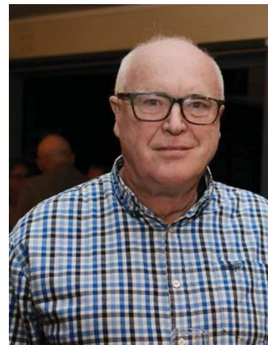
Michael Wilson McCutcheon Award.