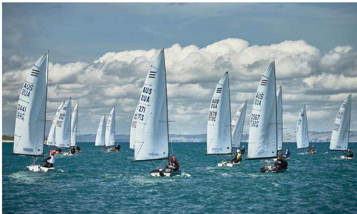
Contenders competing for State Titles at SsYC