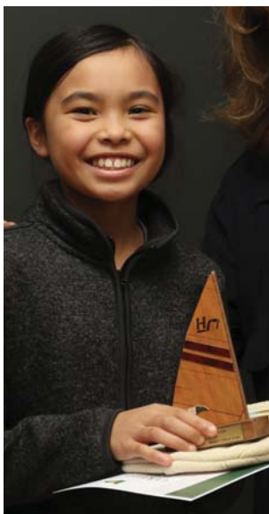
Abi Chen Low Resilience Award