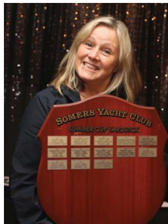
Diana Nutting Summer Cup Yardstick