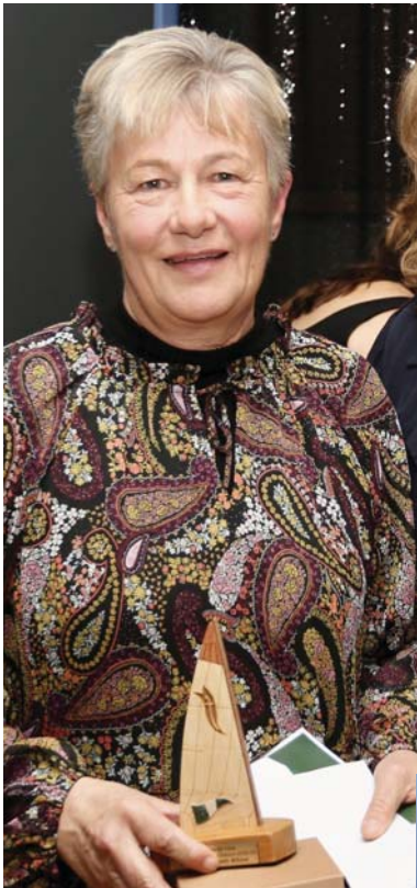
Wendy Wilson Line Honours & Stan Byrne Cup