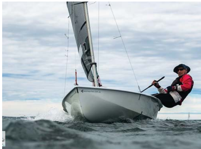
An action shot.