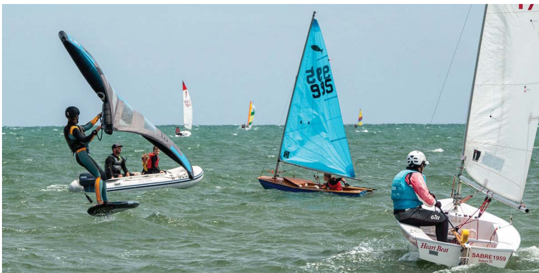
Catamarans, Monohulls, Wing Foils and Sea Rescue all at SsYC.