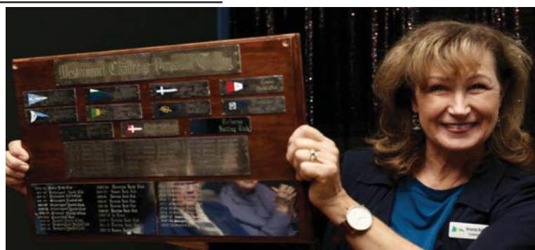
SsYC winners of the Westernport Challenge