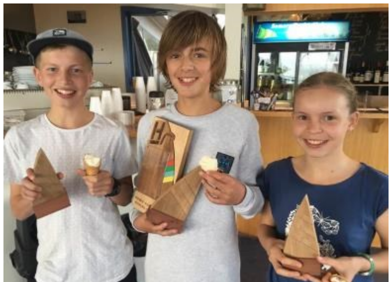
Winners of the Hobie Hawk Titles