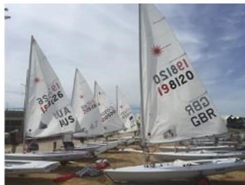
Rigging up at the VIC State Championships