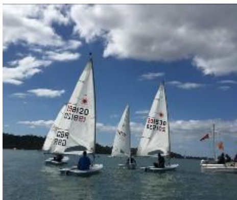
Under a minute to the start of an Easter Regatta race