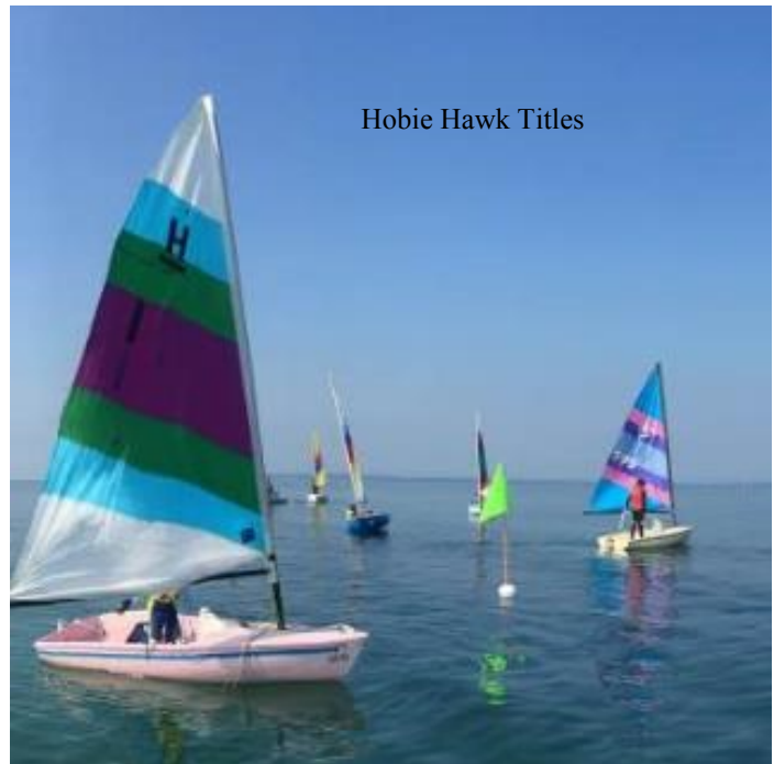
Hobie Hawk Titles