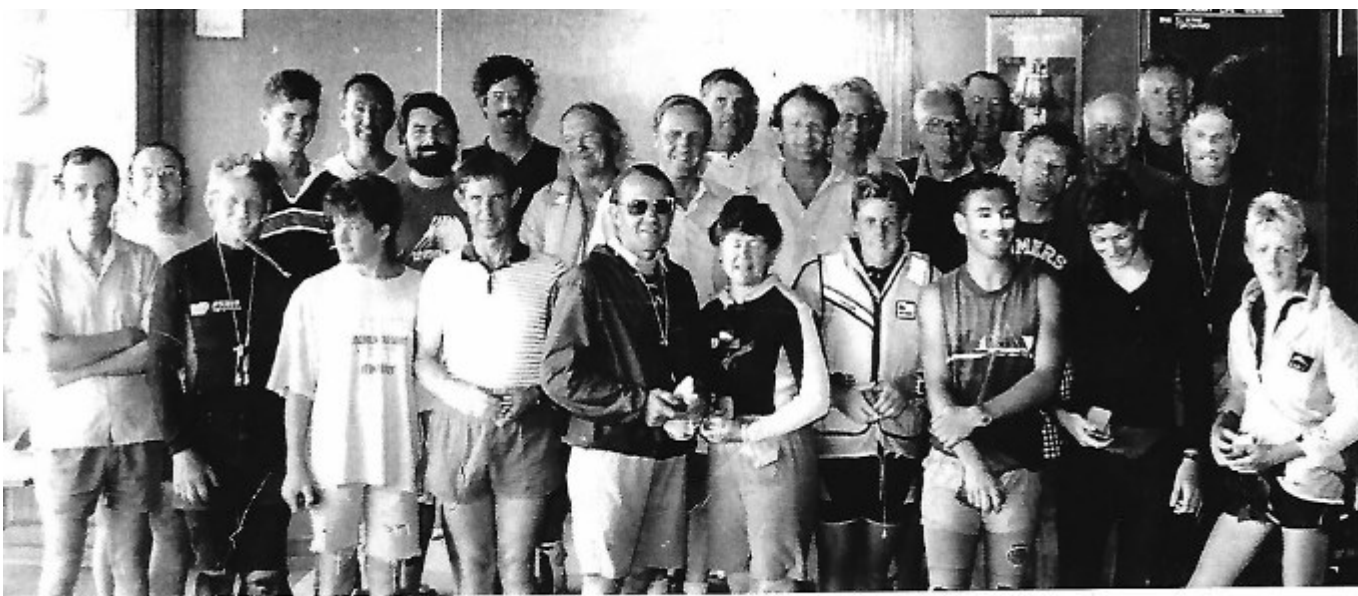
1986 WINNING WESTERN PORT CHALLENGE TEAM S.Y.C.