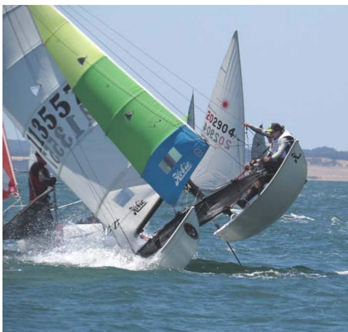
Westernport Challenge conditions playing havoc for Meagan Bursa and Pip Pietromonaco

It was a huge day with a slow sail/tow there, a delayed start due to lack of wind, then a hectic race with a fleet of almost 70 boats going around the same buoys in very strong tides with a gusty offshore wind.