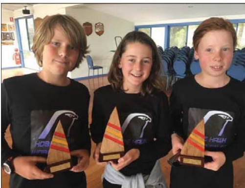
Above Hobie Sailors