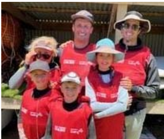
Somers SHARKS won all their qualifying races and were narrowly defeated by Flinders in the A Division final.