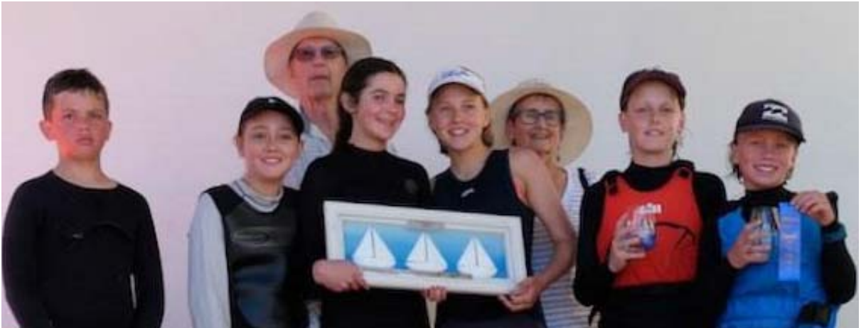
Somers SPIRIT won the C Division final