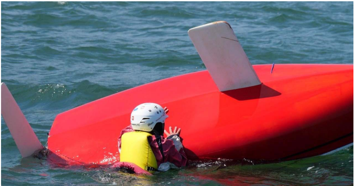
Finding which way is up when sailing Down Under.