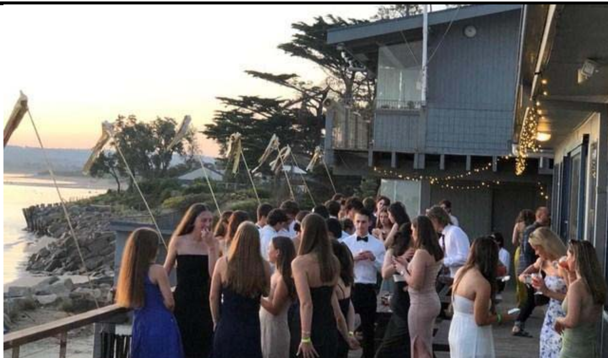
Hot Somers Ball. Fairy lights and silky drapes adorned the clubhouse for our young sailors who swapped their wet suit for formal elegance.