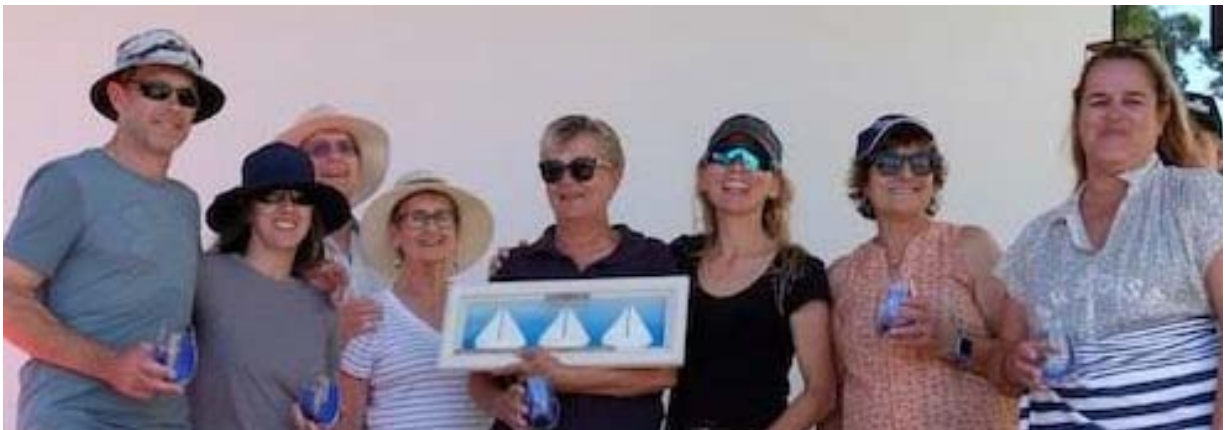
Somers BIRDS of SPRAY narrowly defeated Merricks in the B Division finals.