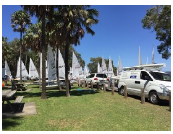
Saturday morning-My boat 198120

Conditions were tricky all weekend with 15-20 knot NE breeze rising to 20-25 knots at the end of Saturday. The temperature was 30C+ which meant that lake spray was warm! The Lasers were divided into fleets of 4.7/Radials (49 boats) and Standard rigs containing 65 boats.