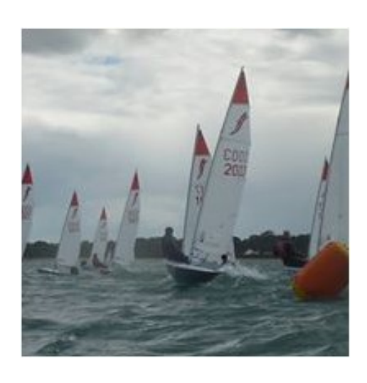
Approaching the Windward Mark