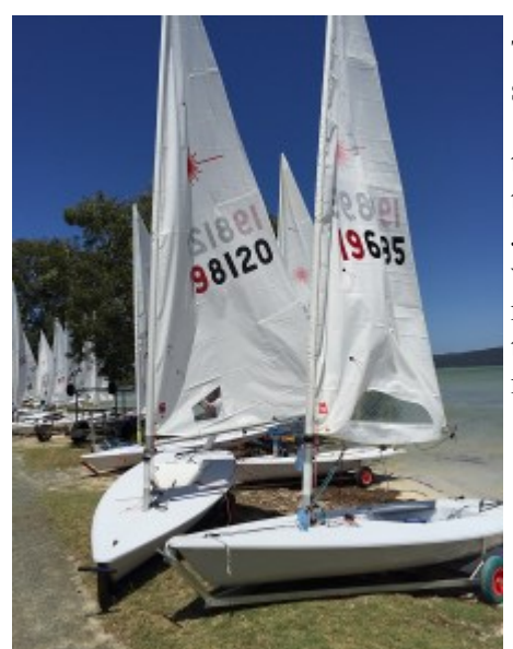
My Laser 198120 next to my older brother's Laser

The first three races on Saturday were hard work as the wind increased and a short-ish line made starts 'interesting' (read incredibly chaotic!). Every start had 1 or 2 general recalls and numerous black flag victims (luckily, I wasn't one of them). These were the first big fleet starts I had had in the Laser since a UK Na-