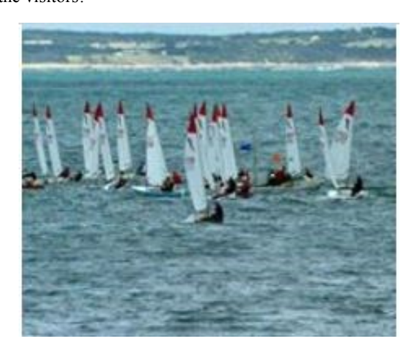
Sabres surrounding the start boat

Unfortunately the weather was not in the least "Somery" but cold, wet and at times very windy. One of the visitors even suggested that our club should be renamed "Winters"! However the warm welcome, relaxed atmosphere and friendly assistance from the many Somers volunteers resulted in high praise from the visitors!