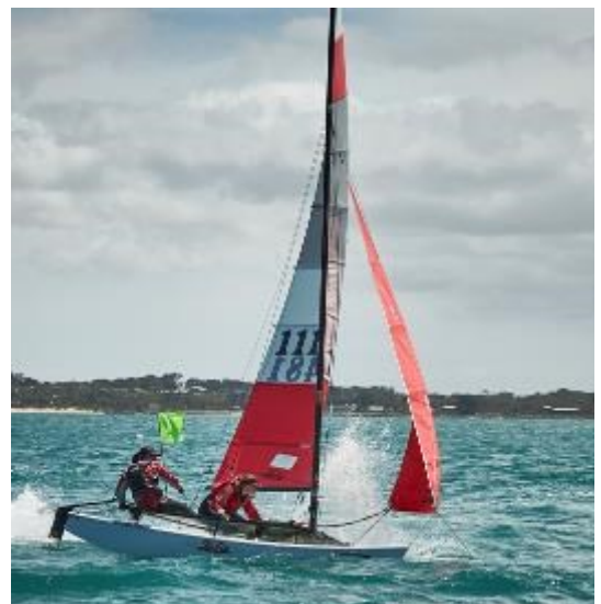
Right Lining up for the start