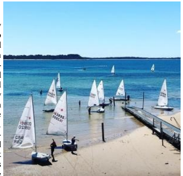
Heading out for the races at Point Leo