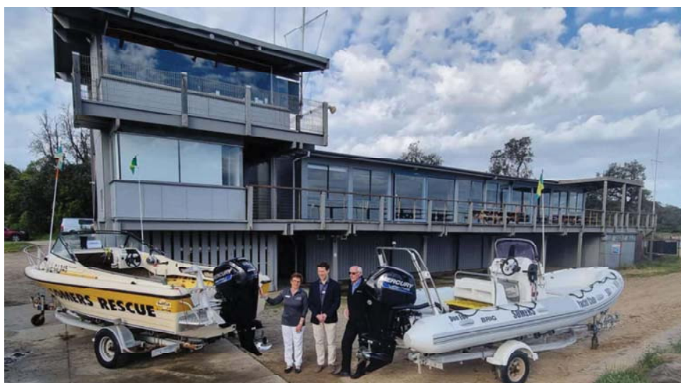
Saturday 21st October 2023. We are very grateful for our generous local Bendigo Bank Balnarring for contributing to the two new motors for our patrol boats.