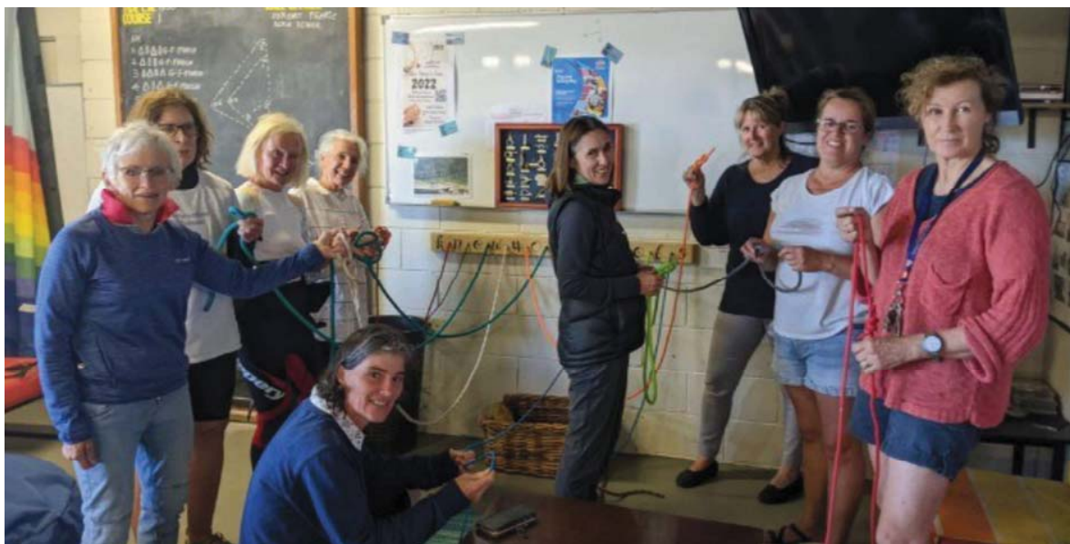
On a poor weather day SWISH sailors continue to learn their ropes.