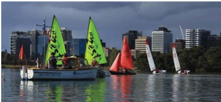
Sailing among the skyscrapers and black swans under a darkening sky at CitySail.