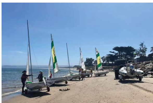
SWISH boats and RIB ready to set sail.