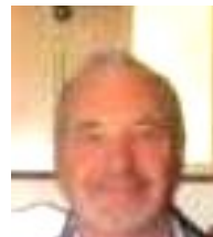
Steve Brown Bar