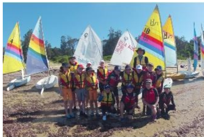
Sailing School 2-16-2017