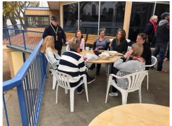
SWISH participants discussing sailing tactics