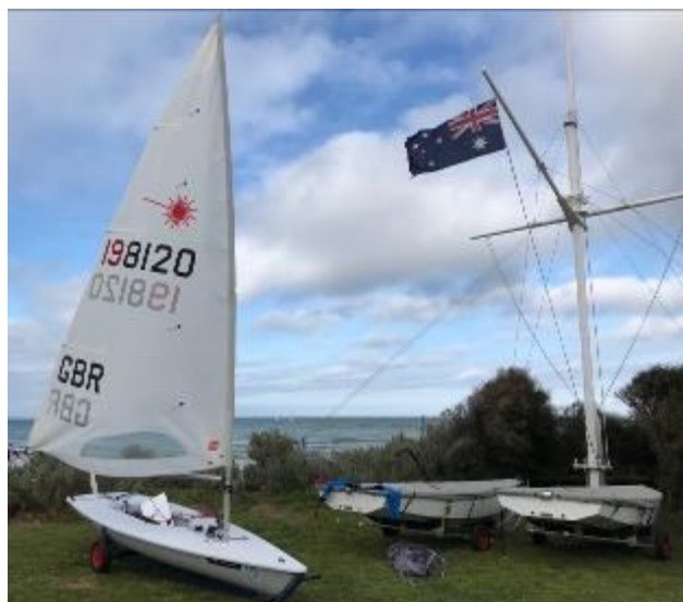
Simon rigged and ready to go on Sunday morning

In August Lucy and Simon competed in Sail Mordi (26/27 th August) at Mordialloc Sailing Club. Saturday was a sunny light wind day and only two races were completed. Sunday was breezier and the wind slowly picked up as it moved further round to the south and four races were completed although the last windy race was tough for all! Simon finished 3 rd overall and in the prizes with Lucy 4 th (and second lady).