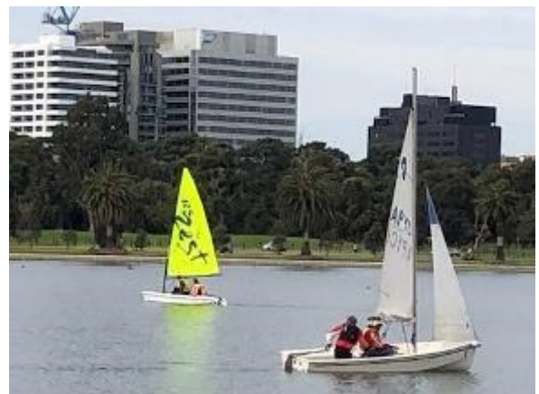
SWISH on Albert Park Lake