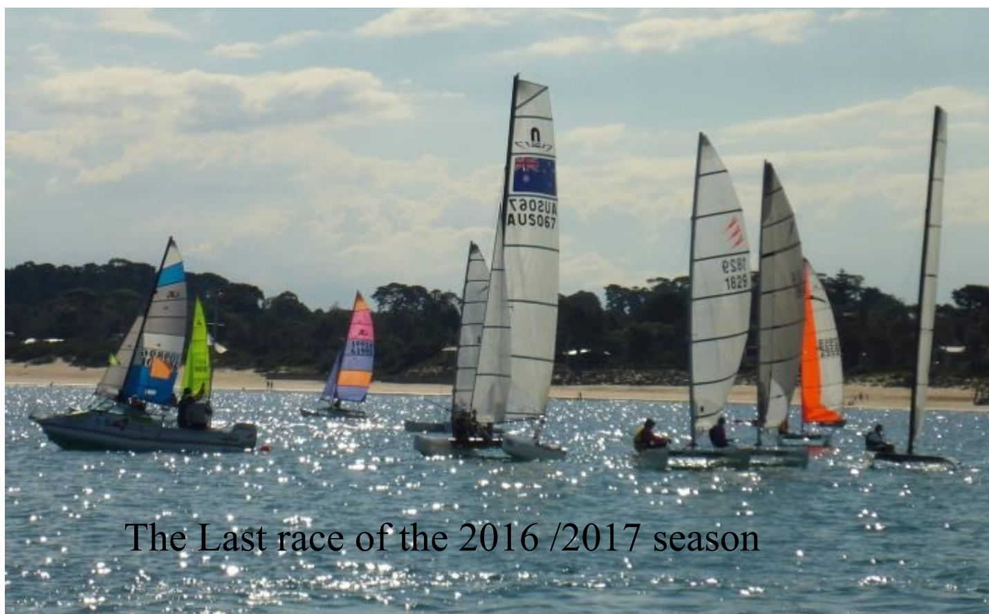
The Last race of the 2016 /2017 season