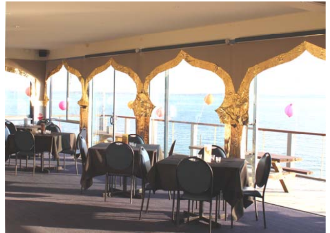
The club house transformed into a Bedouin's tent