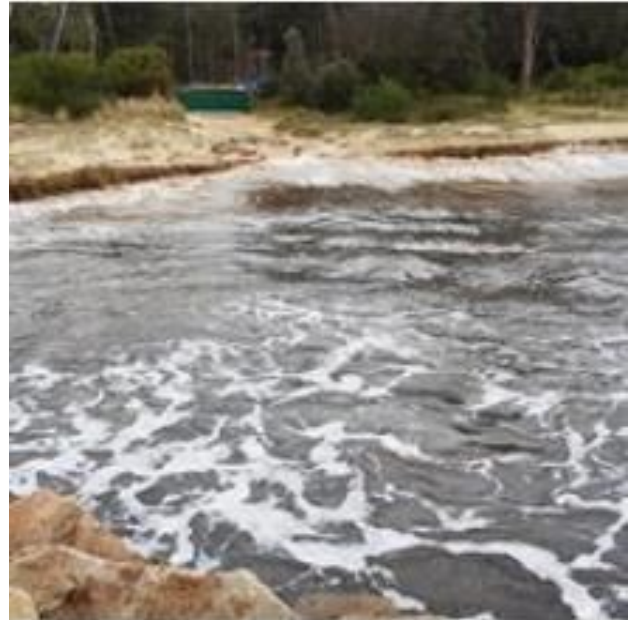
July 16–19th Storms, high tides and huge swells at Somers