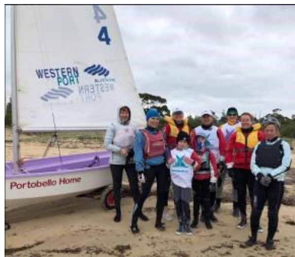
SWISH rugged up for winter sailing At Western Port Yacht Club

Renovate or Rejuvenate Your Trailer & Look New Again Sandblasted & 3 Coats of Epoxy Coatings Macspec Inspection Pty Ltd ABN 21579355483 Athol Stone 0418 382 968