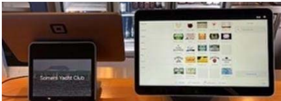
Cashless bar purchases are here to stay and the only way.