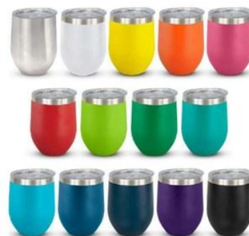
SsYC drink bottles and keep cups - available from the Windward Mark